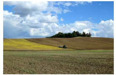
Agriculture company 4,000 ha for sale