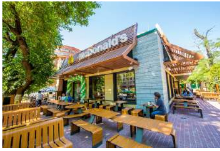
We invest in Ukraine: McDonald's (US)