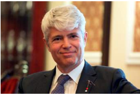
What are the main problems for Swiss investors in Ukraine?